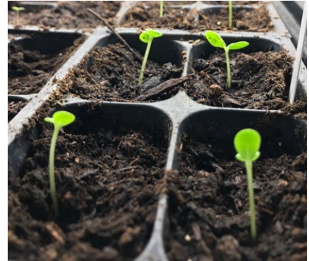
Veggie starts in the TTCD office (March).

Tyonek Grown veggie sales will be held in Tyonek throughout the summer. To learn about market dates and produce availability, please check the TTCD Facebook page.