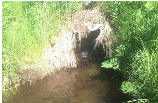
This upper Indian Creek culvert blocks salmon from reaching upstream spawning and rearing habitat, and is scheduled for replacement in 2017.

This summer, TTCD plans to complete two culvert replacements in the Tyonek area to improve habitat access for salmon. Please visit TTCD's Facebook page throughout the summer to learn about progress on these projects.