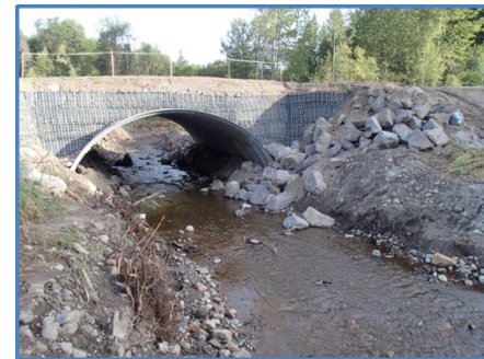
Below: Site in September, with a 28' wide culvert that allows for fish passage.

Are you a District resident or stakeholder? TTCD wants to work with you to help you achieve your conservation goals!