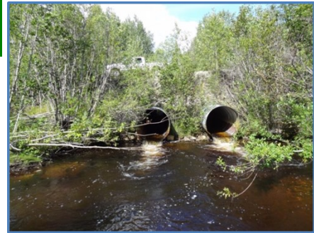
Above: Site before restoration project.

TTCD hopes to continue to complete projects such as this that benefit the land, the resources, and the people of our District.