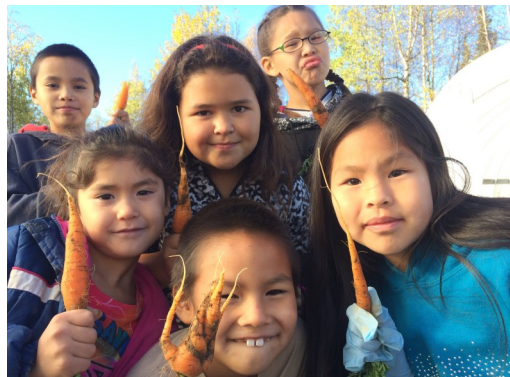
Above: Tebughna School students display carrots that they harvested from the Tyonek Garden.